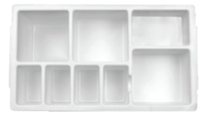
Disposable Insert A for 13 mm tube rack