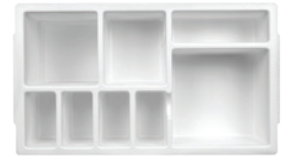
Disposable Insert B for 16 mm tube rack